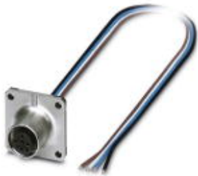
Sensor/Actuator flush-type socket, 4-pos., M12, A-coded, front/square flange mounting, with 0.5 m TPE litz wire, 4 x 0.34 mm 2

Please be informed that the data shown in this PDF Document is generated from our Online Catalog. Please find the complete data in the user's documentation. Our General Terms of Use for Downloads are valid ( http://phoenixcontact.com/download )