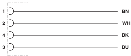
Contact assignment of the M12 plug and the M12 socket