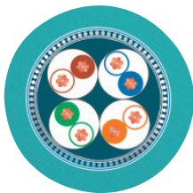
Ethernet, flexible, CAT5 [94B]