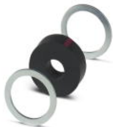
Notched seals/2 washers, for pressure screws, type Pg21

Please be informed that the data shown in this PDF Document is generated from our Online Catalog. Please find the complete data in the user's documentation. Our General Terms of Use for Downloads are valid ( http://download.phoenixcontact.com )