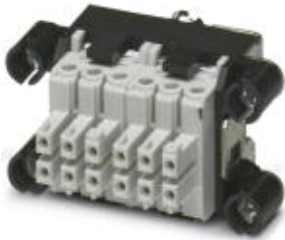
Contact insert set for sleeve side, sleeve frame with PE, 4 fixing screws, 6-pos. contact inserts preassembled, 6 coding profiles

Please be informed that the data shown in this PDF Document is generated from our Online Catalog. Please find the complete data in the user's documentation. Our General Terms of Use for Downloads are valid ( http://phoenixcontact.com/download )