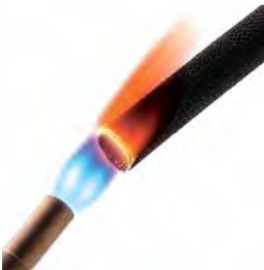
Insultherm resin saturated braided fiberglass sleeving is ideal in areas where fire and extremely high temperatures create a hazard to personnel and equipment.

FGN is available in a wide range of diameters. It installs easily over a variety of applications to either deflect or retain heat in environments up to 1,200°F.