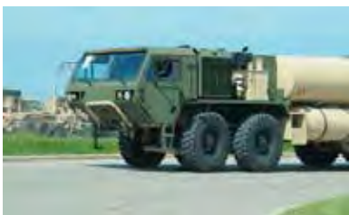
Hoses insulated with Insultherm can perform better in the demanding environments where multi terrain equipment is used.