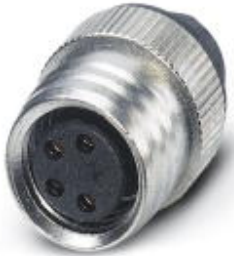
Sensor/actuator flush-type socket, 3-pos., M8, with straight solder connection

Please be informed that the data shown in this PDF Document is generated from our Online Catalog. Please find the complete data in the user's documentation. Our General Terms of Use for Downloads are valid ( http://download.phoenixcontact.com )