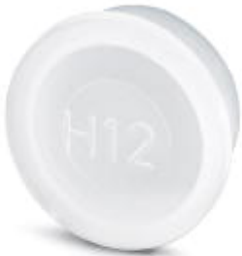
Plastic dust protection cap for connectors with M17 external thread

Please be informed that the data shown in this PDF Document is generated from our Online Catalog. Please find the complete data in the user's documentation. Our General Terms of Use for Downloads are valid ( http://phoenixcontact.com/download )