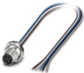
Sensor/actuator flush-type plug, 5-pos., M12, A-coded, rear/screw mounting with Pg9 thread, with 0.5 m TPE litz wire, 5 x 0.34 mm 2 , stainless steel version

Please be informed that the data shown in this PDF Document is generated from our Online Catalog. Please find the complete data in the user's documentation. Our General Terms of Use for Downloads are valid ( http://phoenixcontact.com/download )