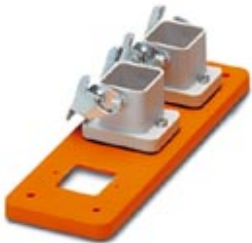
Adapter plates, with reinforced wall, 3 cutouts for connectors HC-D 7, cutout 3 x 21.5 x 21.5, for type B24 to D7

Please be informed that the data shown in this PDF Document is generated from our Online Catalog. Please find the complete data in the user's documentation. Our General Terms of Use for Downloads are valid ( http://download.phoenixcontact.com )