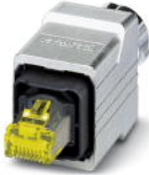
RJ45 plug-in connector, IP67, with push/pull interlocking (version 14), metal housing, for 10 Gbps, for AWG 24 ... 27 stranded conductors

Please be informed that the data shown in this PDF Document is generated from our Online Catalog. Please find the complete data in the user's documentation. Our General Terms of Use for Downloads are valid ( http://download.phoenixcontact.com )