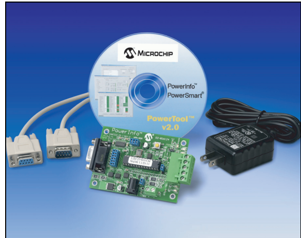
FIGURE 1-1: BOARD PHOTO