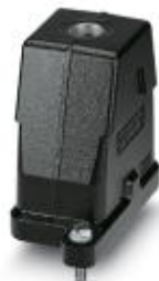
HEAVYCON B6 sleeve housing, HPR series, with screw locking, with M20 thread, straight outlet, for increased environmental and EMC requirements

Please be informed that the data shown in this PDF Document is generated from our Online Catalog. Please find the complete data in the user's documentation. Our General Terms of Use for Downloads are valid ( http://phoenixcontact.com/download )