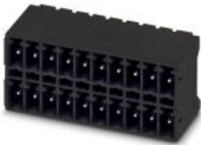
The figure shows a 10-pos. version with 20 contacts

Please be informed that the data shown in this PDF Document is generated from our Online Catalog. Please find the complete data in the user's documentation. Our General Terms of Use for Downloads are valid ( http://phoenixcontact.com/download )