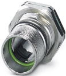
Device connector, rear mounting, straight, SPEEDCON locking, M23, Seal, axial, Central fixing, shielded: yes

Please be informed that the data shown in this PDF Document is generated from our Online Catalog. Please find the complete data in the user's documentation. Our General Terms of Use for Downloads are valid ( http://phoenixcontact.com/download )