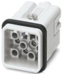
HEAVYCON plug insert, Q12 series, 12-pos., crimp connection, with coding option.

Please be informed that the data shown in this PDF Document is generated from our Online Catalog. Please find the complete data in the user's documentation. Our General Terms of Use for Downloads are valid ( http://phoenixcontact.com/download )