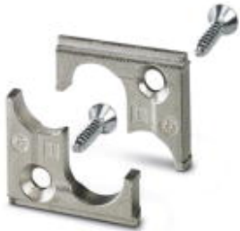
Adapter V, application: Shield adapters

Please be informed that the data shown in this PDF Document is generated from our Online Catalog. Please find the complete data in the user's documentation. Our General Terms of Use for Downloads are valid ( http://phoenixcontact.com/download )