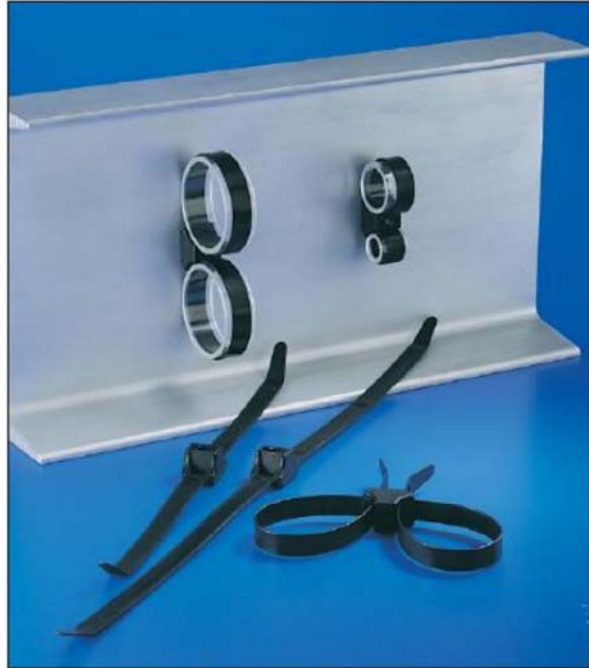
U.S. Patent Number 5,966,781

Available in two lengths, the dual clamp ties accommodate bundles ranging from .25 inches to 2.3 inches. The flexible wide straps minimize pinching of hoses and convoluted tubing. The straps are also releasable.