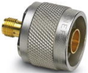
Antenna adapter, frequency range: 0.3 GHz ... 6 GHz, connection: N (male) -> SMA (female)

Please be informed that the data shown in this PDF Document is generated from our Online Catalog. Please find the complete data in the user's documentation. Our General Terms of Use for Downloads are valid ( http://phoenixcontact.com/download )