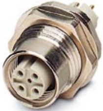
Sensor/Actuator flush-type socket, 4-pos., M12, A-coded, rear/screw mounting with Pg9 thread, with straight solder connection

Please be informed that the data shown in this PDF Document is generated from our Online Catalog. Please find the complete data in the user's documentation. Our General Terms of Use for Downloads are valid ( http://download.phoenixcontact.com )