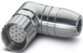
The figure shows the 12-pos. product version

Cable connector, angled, shielded: Yes, Screw locking, M23, Number of positions: 16, Type of contact: Socket, Solder connection, Cable diameter: 3 mm ... 10.5 mm