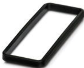
Profile gasket for type B24 supporting base element

Please be informed that the data shown in this PDF Document is generated from our Online Catalog. Please find the complete data in the user's documentation. Our General Terms of Use for Downloads are valid ( http://phoenixcontact.com/download )