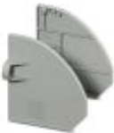
Flange cover, Color: gray