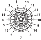
Connector pin assignment