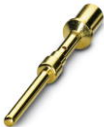
Crimp contact, turned, Single contact, contact diameter: 2 mm, crimp range: 0.25 mm 2 ... 1 mm 2

Please be informed that the data shown in this PDF Document is generated from our Online Catalog. Please find the complete data in the user's documentation. Our General Terms of Use for Downloads are valid ( http://phoenixcontact.com/download )