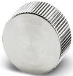
Metal dust protection cap for connectors, with M17 external thread

Please be informed that the data shown in this PDF Document is generated from our Online Catalog. Please find the complete data in the user's documentation. Our General Terms of Use for Downloads are valid ( http://phoenixcontact.com/download )