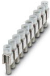
Fixed bridge, Number of positions: 10, Color: silver

Please be informed that the data shown in this PDF Document is generated from our Online Catalog. Please find the complete data in the user's documentation. Our General Terms of Use for Downloads are valid ( http://download.phoenixcontact.com )