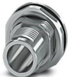
M12 SPEEDCON housing screw connection for M12 male inserts, with O-ring, for all SPEEDCON-capable THR and wave soldering contact carriers

Please be informed that the data shown in this PDF Document is generated from our Online Catalog. Please find the complete data in the user's documentation. Our General Terms of Use for Downloads are valid ( http://phoenixcontact.com/download )