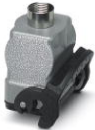
HEAVYCON B6 coupling housing, with single locking latch, height: 77.5 mm, with 1 x Pg29 gland, straight cable outlet

Please be informed that the data shown in this PDF Document is generated from our Online Catalog. Please find the complete data in the user's documentation. Our General Terms of Use for Downloads are valid ( http://download.phoenixcontact.com )