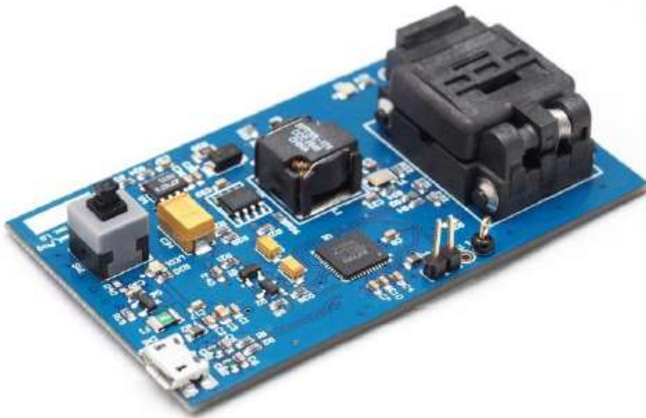
Figure 3.2 UMFT4222PROG-IC Picture

Figure 3.3 shows R40 which needs to be populated by either a 0Ω resistor or a solder bridge.