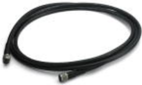
The figure shows a version of the product

Antenna cable, outside diameter: 10 mm (0.4 in.), inner conductor: stranded, attenuation: 1.6 / 2.9 / 5.0 dB at 0.9 / 2.4 / 5.8 GHz, connection: 2 x N (male), cable length: 5 m (16 ft.)